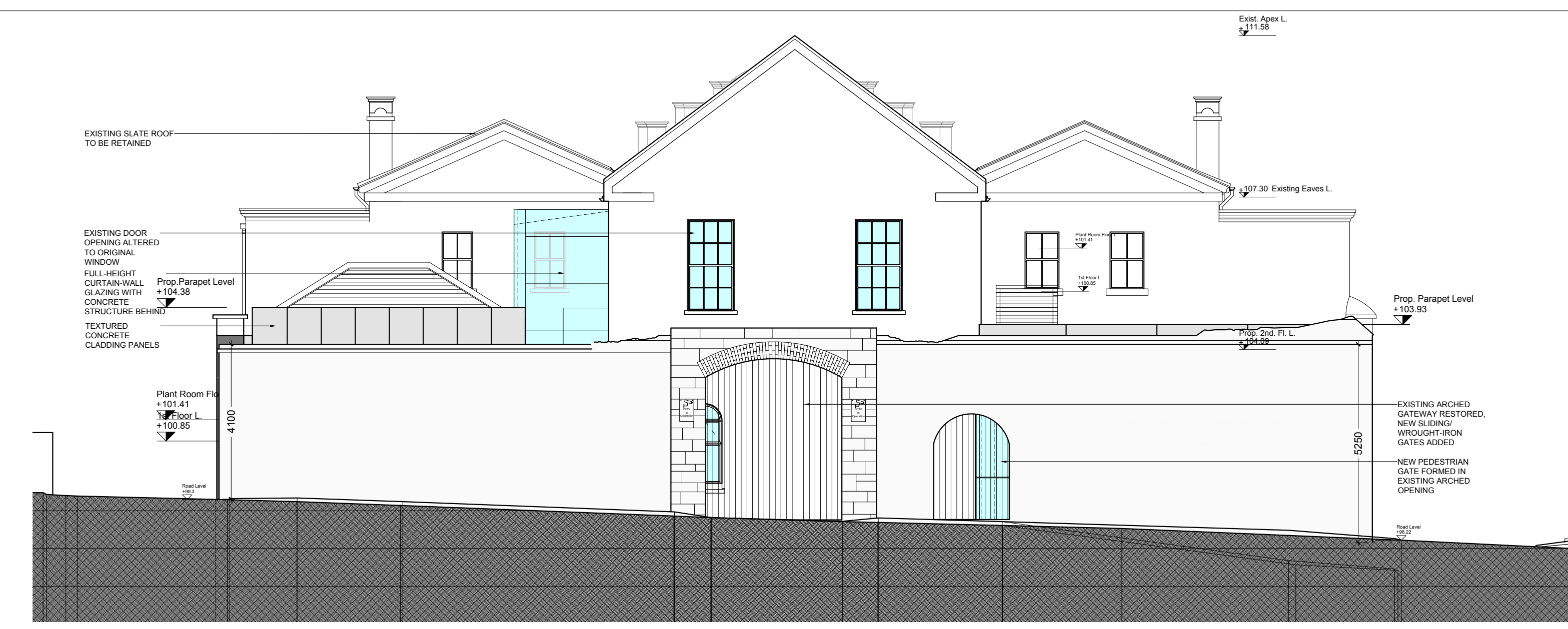
4 PROPOSED WEST ELEVATION SCALE 1:100

NOTES This drawing has been prepared for the following purpose only: PART 8 It should not be used, nor information contained therein be relied upon, for any other purpose whatsoever. All drawings to be read in conjunction with all other related documents and other consultants drawings and documentation. Architects to be informed immediately of any discrepancies before work proceeds.