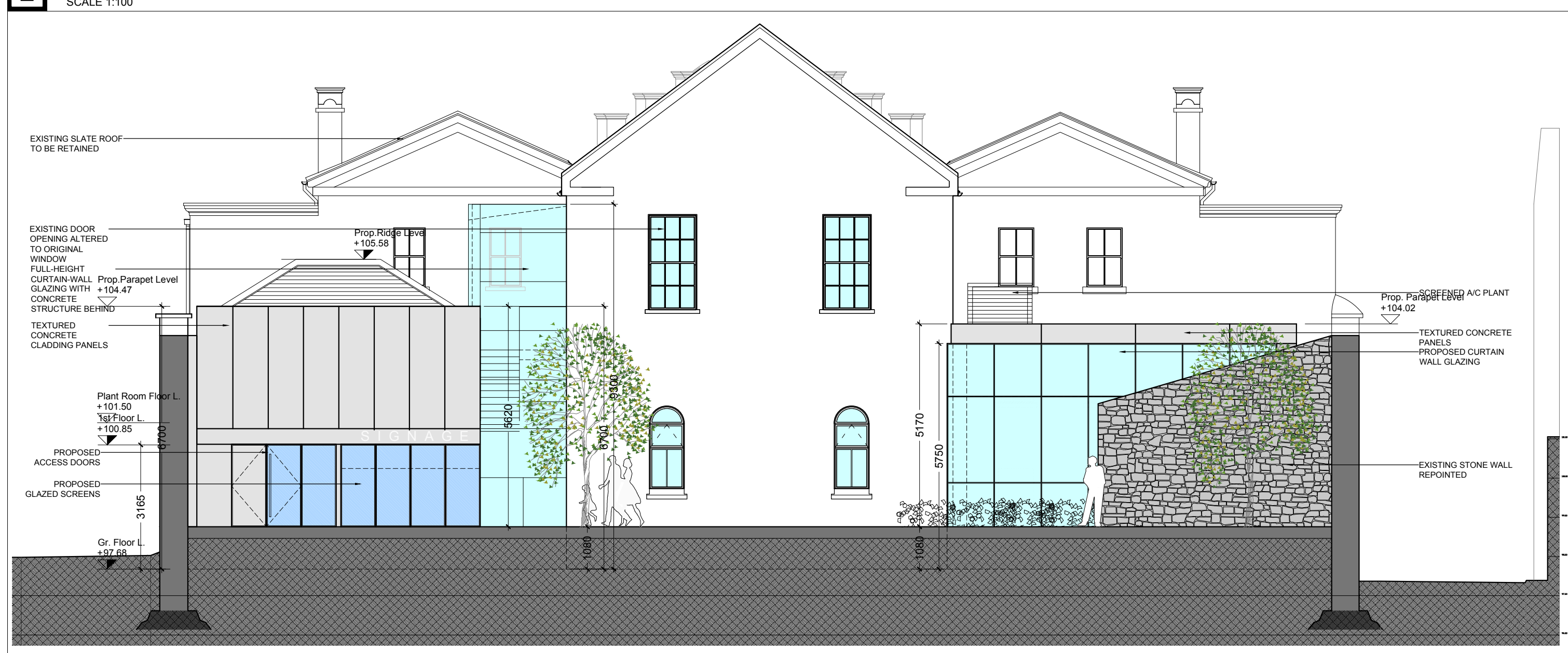
3 PROPOSED COURTYARD ELEVATION/ WEST ELEVATION SCALE 1:100